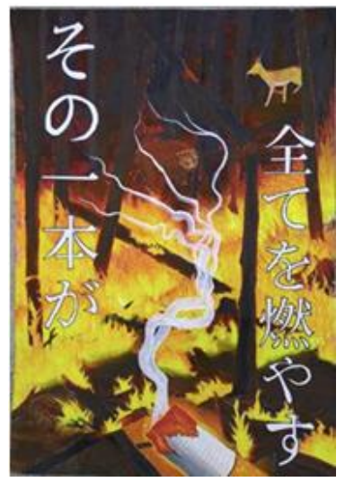
Inazawa Mayor's Award -winning Work of Fire Prevention Poster 2024